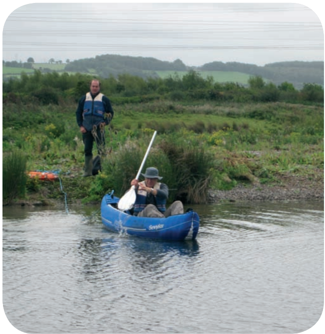
clearing vegetation from nesting island

At the end of September a Pond Restoration project began in the secluded fields with the assistance of contractors and the Trust's Consultancy company. The ponds were in poor health and have been re-profiled and enlarged to provide a much more desirable home for newts, dragonflies and invertebrates. A couple of toads have already been spotted passing through. The spoil from the ponds is in the South Pools field and will be used along with other materials to create an exciting new sand martin bank next year.