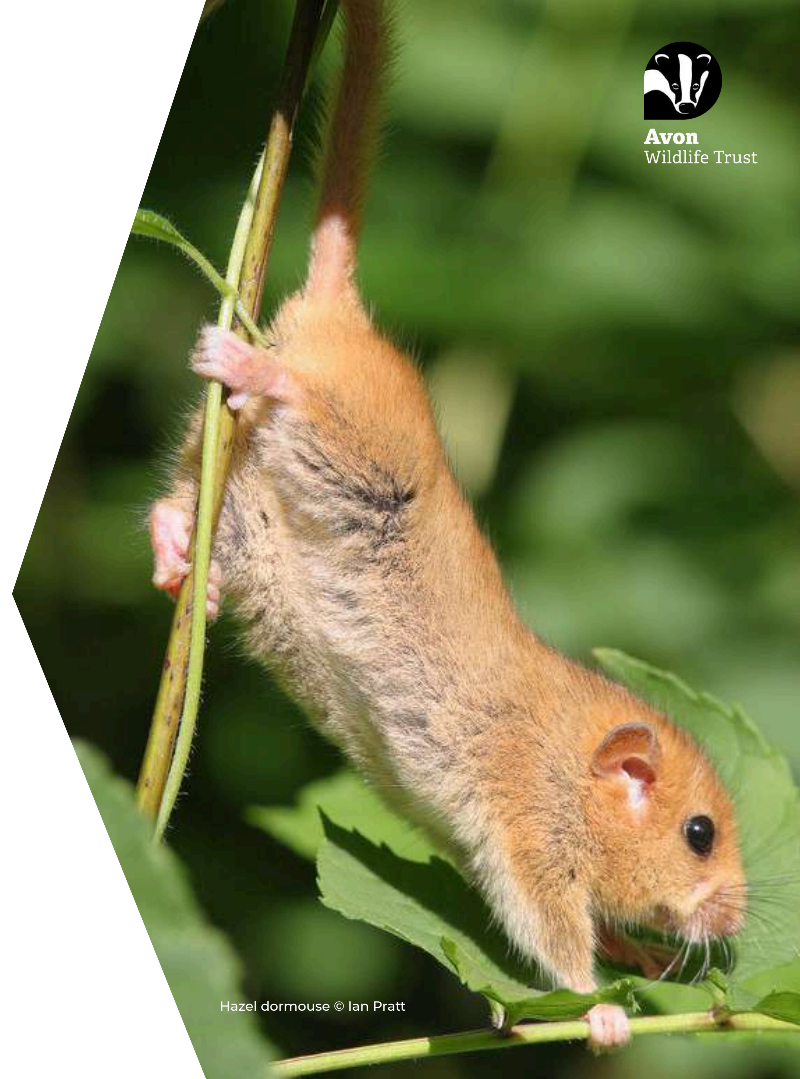
Hazel dormouse

We will advocate for nature at the heart of decision making and demonstrate best practice for nature-positive growth.