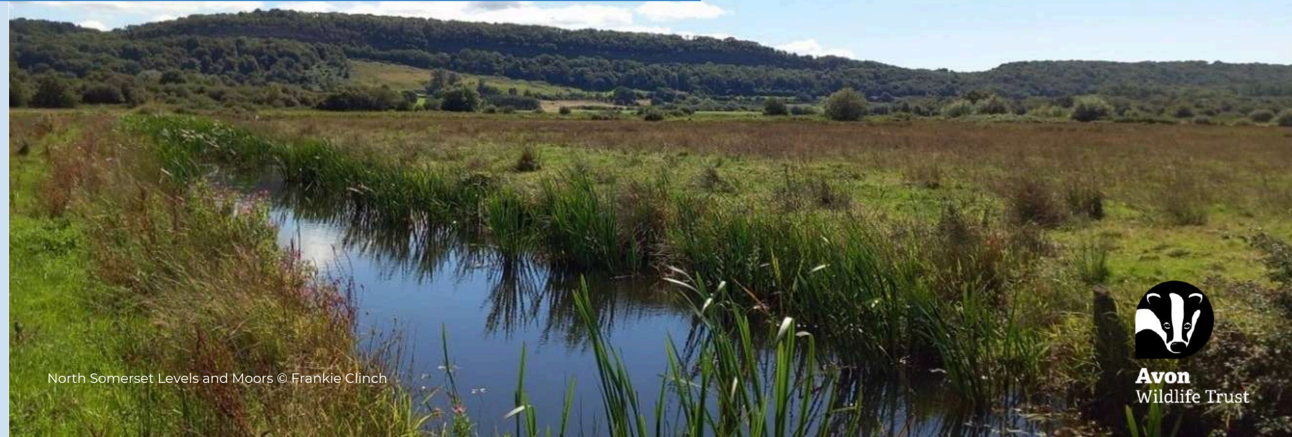
North Somerset Levels and Moors

However, when peatlands are drained and start to degrade, such as those on the North Somerset Levels and Moors, all these benefits are lost, and they move from being a carbon store to a carbon emitter.