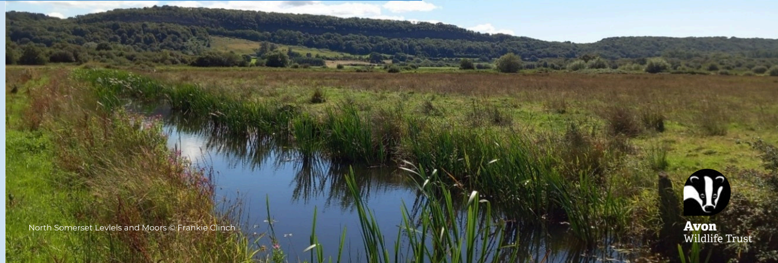
North Somerset Levels and Moors

However, when peatlands are drained and start to degrade, such as those on the North Somerset Levels and Moors, all these benefits are lost, and they move from being a carbon store to a carbon emitter.