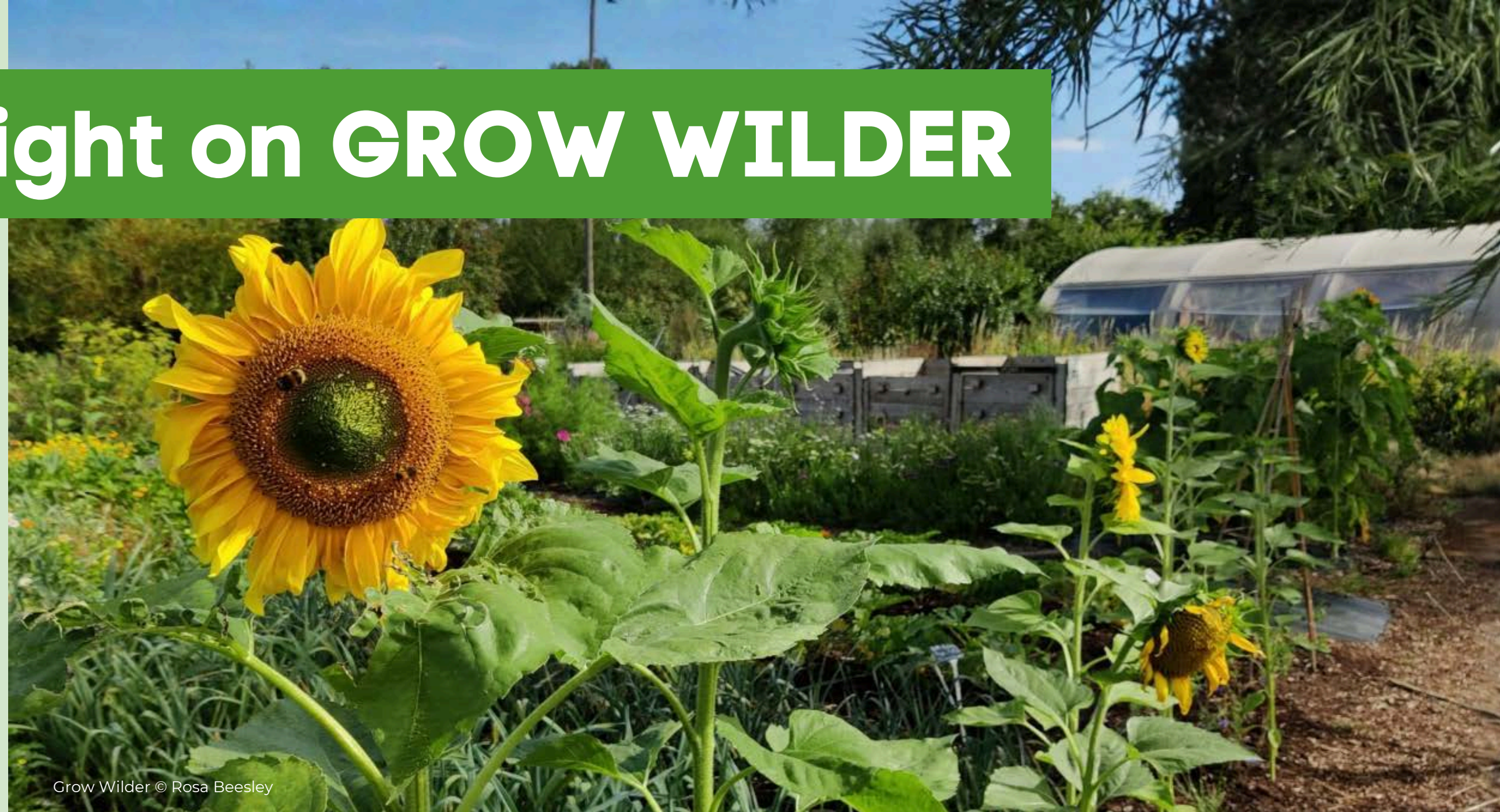
Grow Wilder

The ethos of Grow Wilder is to demonstrate the link between sustainable food production and benefits for nature and people in an urban setting , to inspire others to take action for nature in their neighbourhoods.