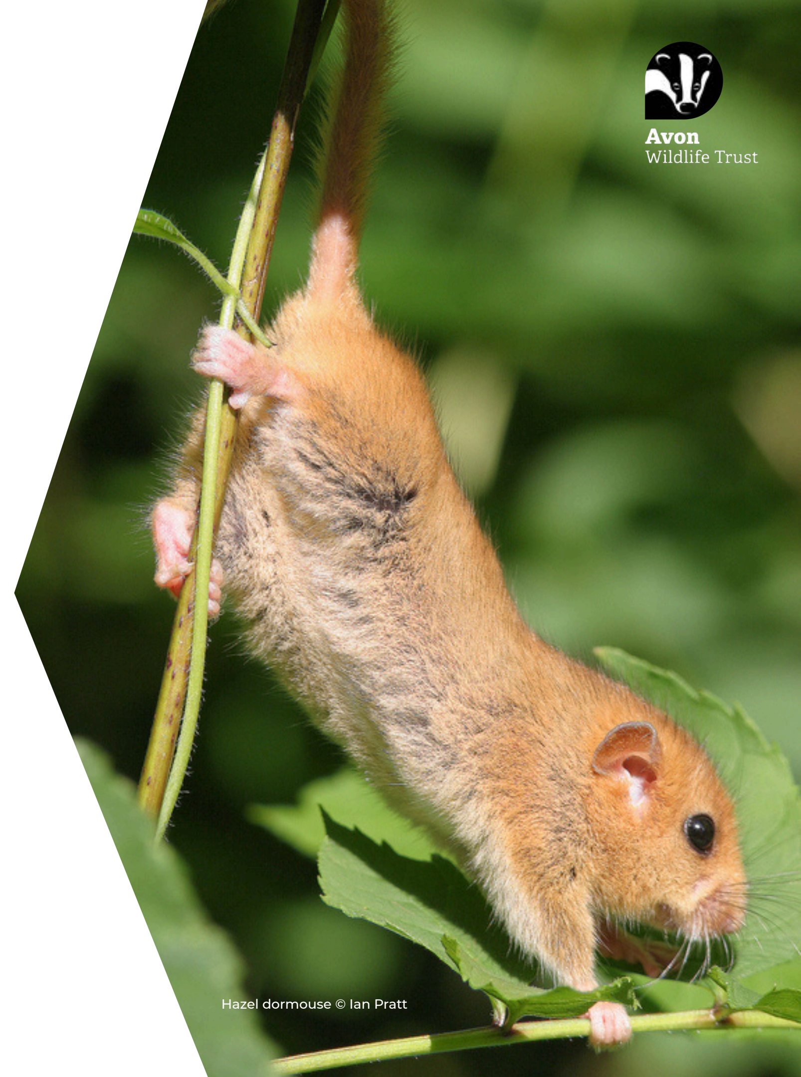
Hazel dormouse

We will advocate for nature at the heart of decision making and demonstrate best practice for nature-positive growth.