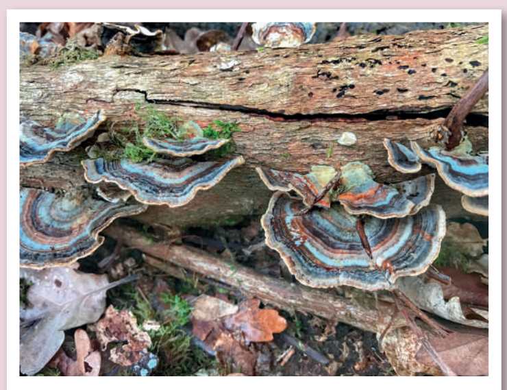
Ben Buckle has been exploring Prior's Woods and has been lucky enough to spot this beautifully coloured Turkey Tail fungus!

We'd love to see your pictures from your wildlife adventures around Avon. Get involved with your community and follow us/share your story on Twitter (@avonwt) and Instagram (@avonwt) or email us on members@avonwildlifetrust.org.uk