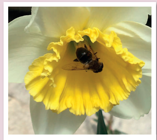
Such a strikingly happy image of Sian James' first bee sighting as it collects nectar from a daffodil, in full bloom. A perfect picture of spring.