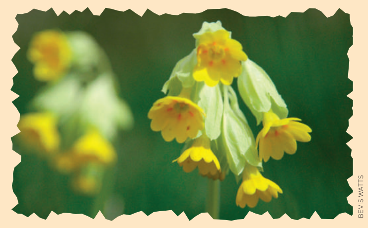
Cowslips An early delicate yellow spring wildflower which gets its name cowslip from the old English 'cow slop', referring to their habit of popping up on patches of grasslands where cows have deposited their pats. Traditionally used in garlands for mayday and spring weddings, cowslips give off a delicious apricot smell (which helps identify them from the similar looking Oxslip!).