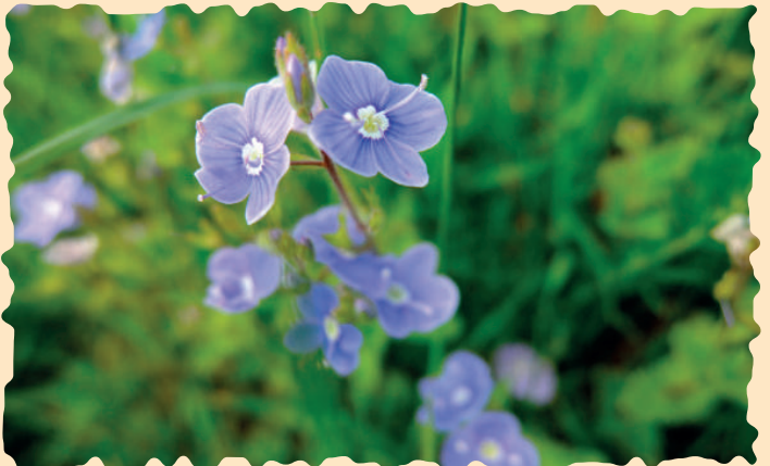
Speedwell are abundant in summer and just as likely to be found on the roadside as a woodland pathway. Their calming colours and habit of growing alongside track ways made them a good luck sign for travellers. As there are many different species, it's a good family to practice your identification skills on. It can be identified by its toothed oval leaves, hairy stem and lilac flowers.

Black knapweed With deep royal purple flowers surrounded by a crown of deep black bracts, knapweeds are reminiscent of thistles, though they aren't in the same family. With its flower heads poking above many of the other meadow plants it's a favourite of butterflies. It's often a great vantage point to get a close up view of colourful insects and add a dash of contrasting colour to photographs. There's some evidence to suggest that Neanderthals left Knapweed bouquets as grave offerings 50,000 years ago!