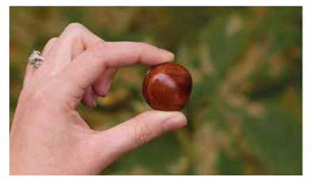
Heather Lampard @heather_lampard Always transported back to my childhood when I see conkers. I used to collect as many as I could – the shinier the better!

We'd love to see your pictures from your wildlife adventures over spring and summer. Sign up for 30 Days Wild, get involved with your community and follow us/share your story on social media @Avonwt , #30DaysWild .