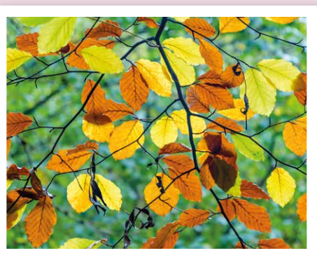
Daniel Hauck @haucksie Loved all of the different coloured leaves on this tree.