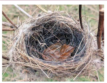
Mil Wilson @milw98 This beautiful nest was found whilst clearing blackthorn from a fence line along the barn owl corridor at Clapton Moor.