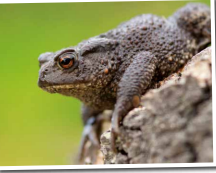
Surveys show that thousands of oncecommon species are declining sharply

The plans fall short of what we need to tackle the challenge