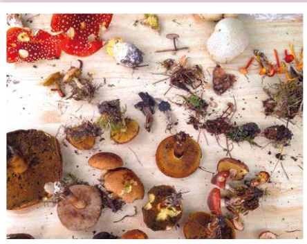
Michael Green @ intrepidforager A corner of the ID table at yesterday's #UKfungusday event from @foreverfungi featuring classic autumn species.