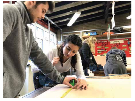
Clevedon School Sixth Form @Clevedon6Form Clevedon Sixth Form Barn Owl Nestbox Project phase 2 begins... measuring the timber!

Here are some of the photos and stories they shared with us over the autumn and winter months.