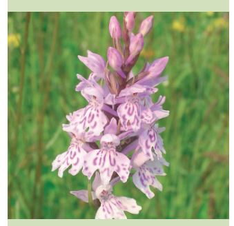
Common spotted orchid

Why don't you... listen out for nightingales in May?