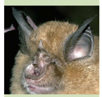
Grtr horseshoe bat