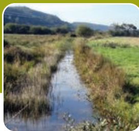
Field boundary rhyne