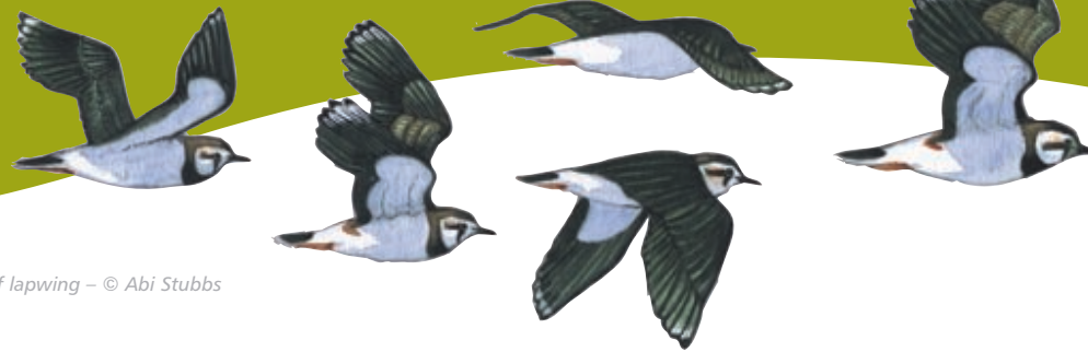
Flock of lapwing

This 3-mile circular walk offers magnificent views, diverse wildlife, and fascinating history.