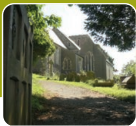
St Michael's Church