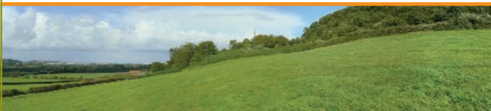
Buzzard – © Abi Stubbs. Meadow at Clapton Moor

A CIRCULAR WALK IN THE GORDANO VALLEY LINKING THE VILLAGE OF CLAPTON-IN- GORDANO WITH CLAPTON MOOR NATURE RESERVE