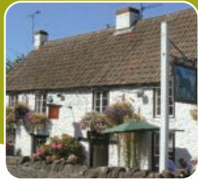
Black Horse Pub