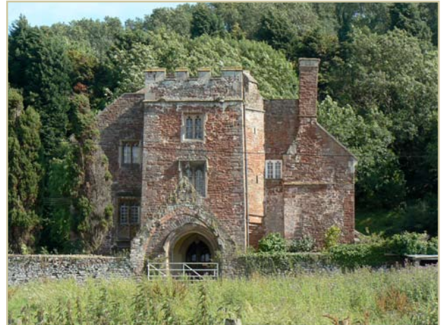
Clapton Court - 5