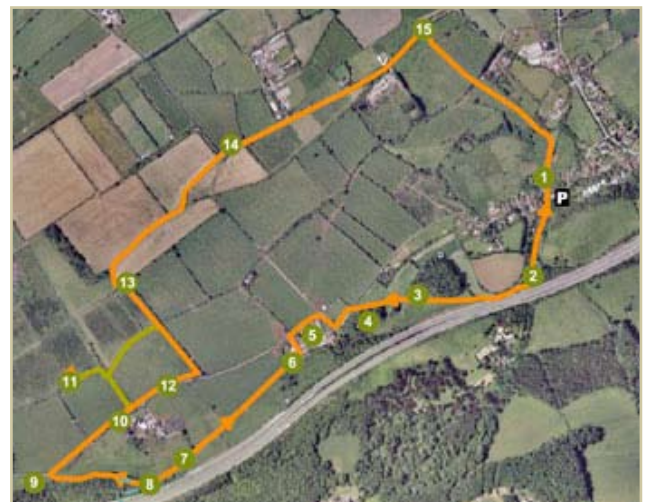
Aerial view of Clapton Circuit showing the start of the Circuit at the Back Horse Inn (Google maps UK)