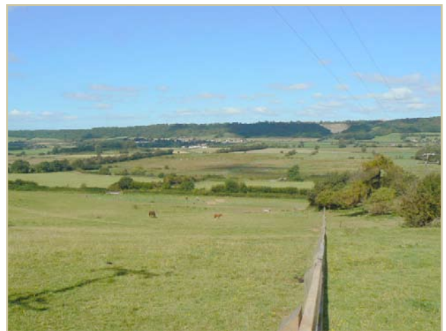
view from panorama - 7