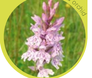
common spotted orchid