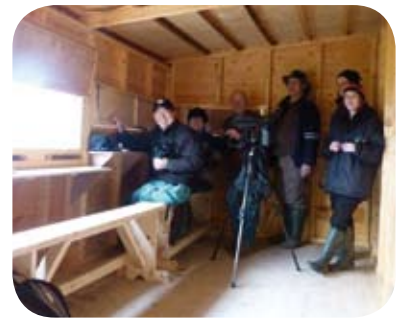
Haven Lodge Care Home residents enjoy the new hide