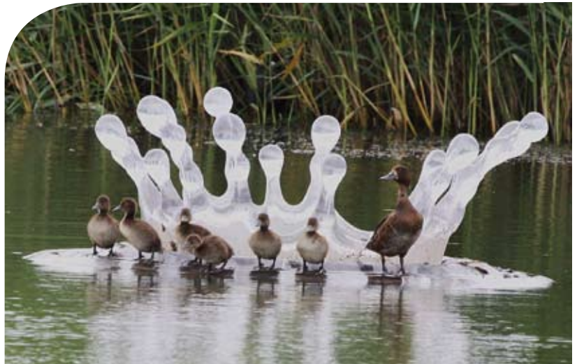
Tufted duck and six ducklings using 'Splash' sculpture for an island rest

All members can also enjoy free access to all 35 of the Trust's nature reserves. Junior Members become part of Wildlife Watch, receiving the special starter pack and six mailings a year filled with wildlife stories, details of family events, activities and things you can do at home or at school. You do, however, need to 'opt in' to become a member for data protection purposes. To activate your membership simply email angeladavies@avonwildlifetrust.org.uk or phone Trust Headquarters at 0117 917 7270 .