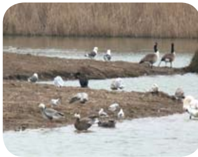
Birds move onto the new island